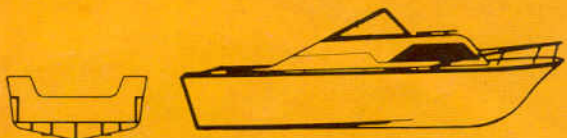
191-C ATLANTIC WEEKENDER — 19'1"